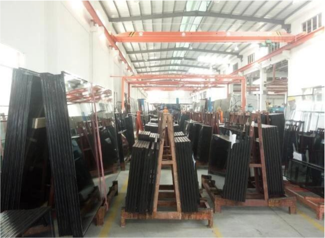
Saftey loading and packing: