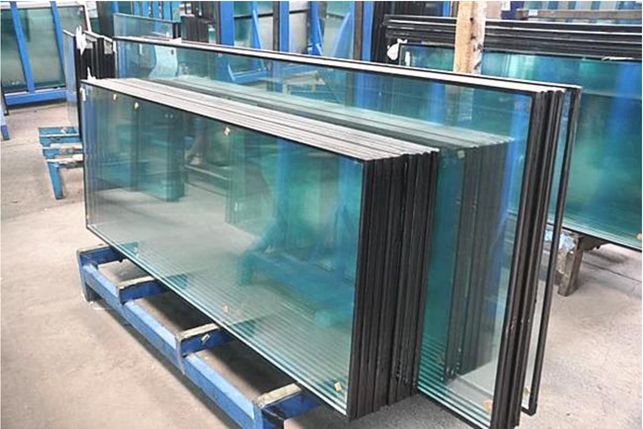
Tempered laminated insulated glass used for curtain wall: