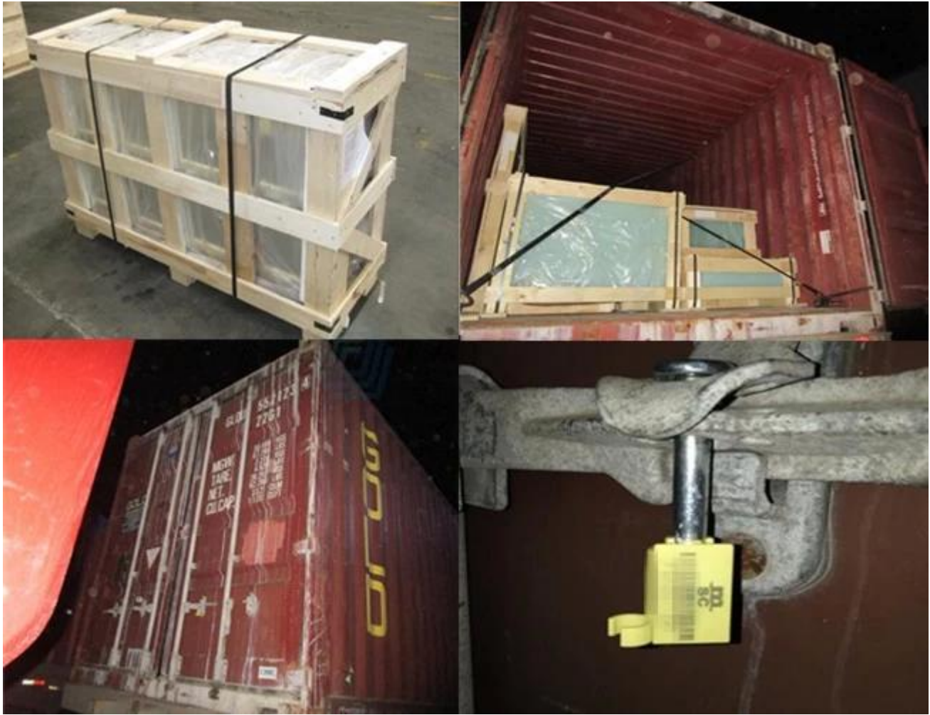
Applications of 8mm Ultra clear tempered glass