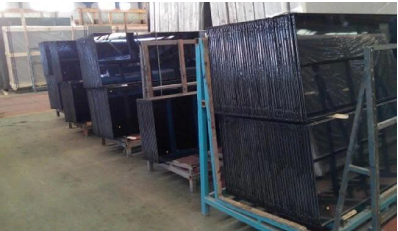
Grey Reflective Insulated Glass for Windows