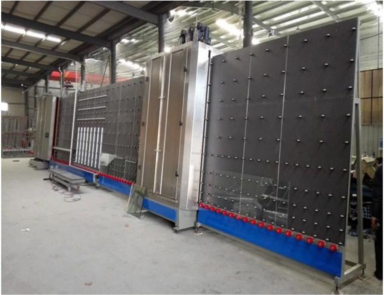
Strong package of insulating glass