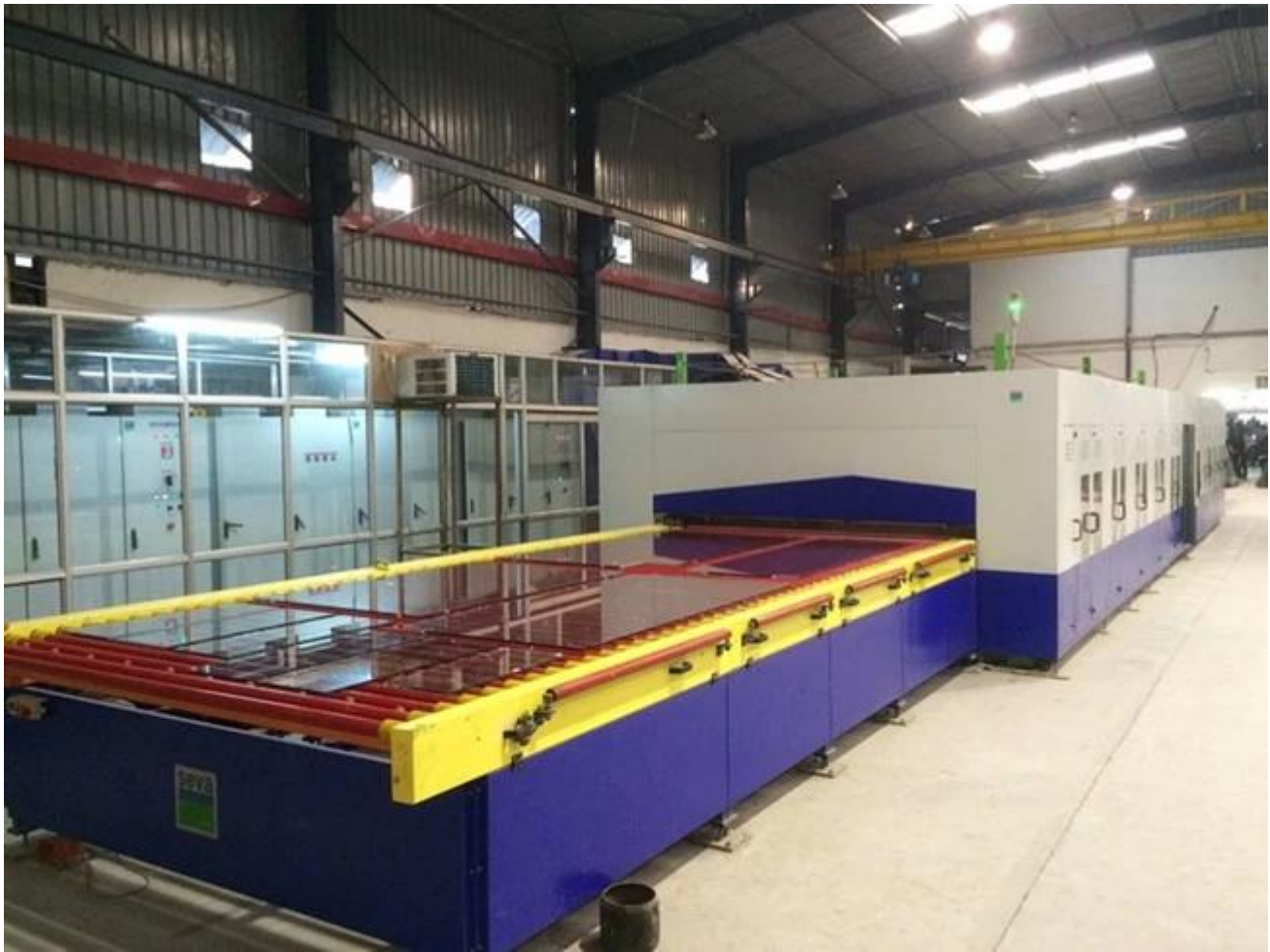
Tempered Glass Safety Packing