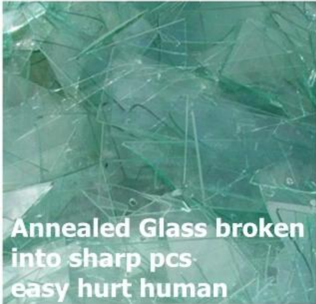
Annealed Glass broken into sharp pcs easy hurt human