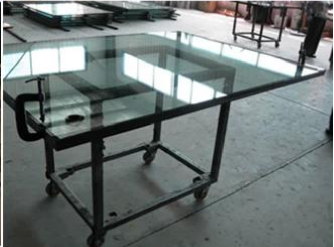
Low E Insulated Glass Application: