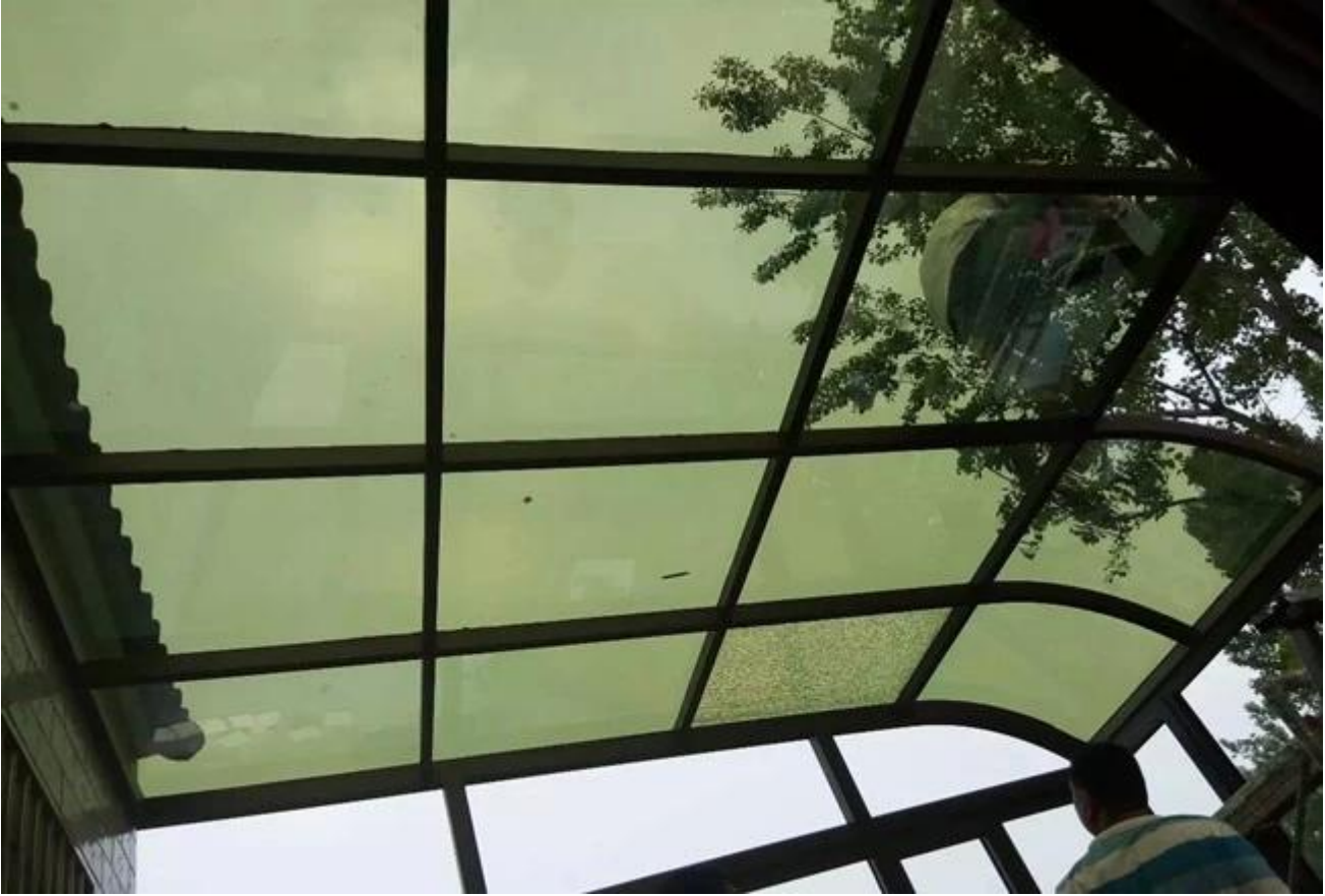
5mm Dark Green Reflective Glass Safety Packing & Loading