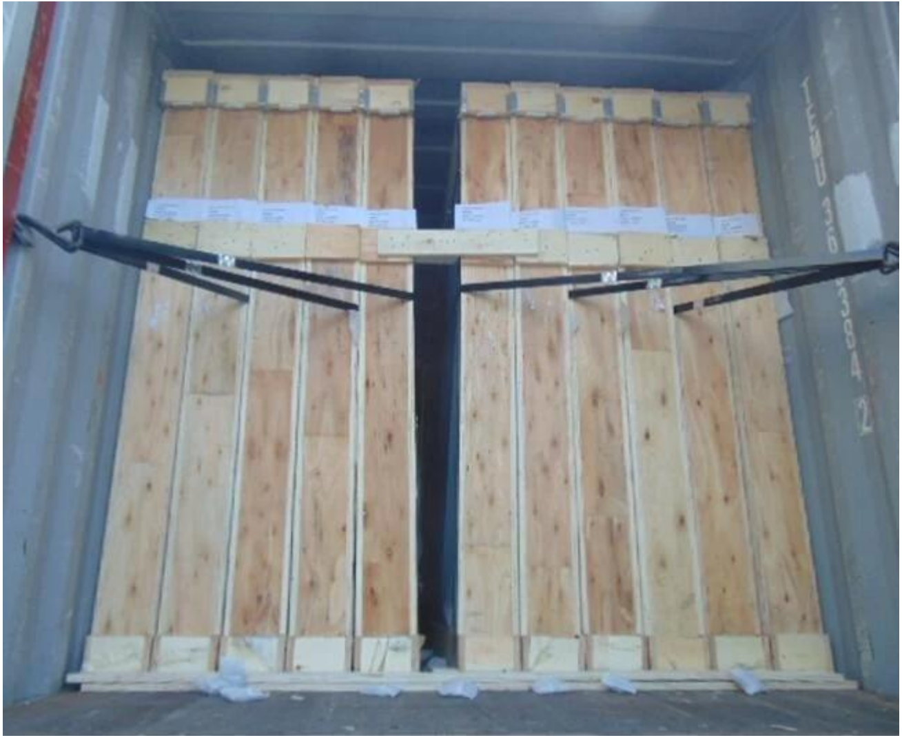
Low Iron Float Glass For Greenhouse