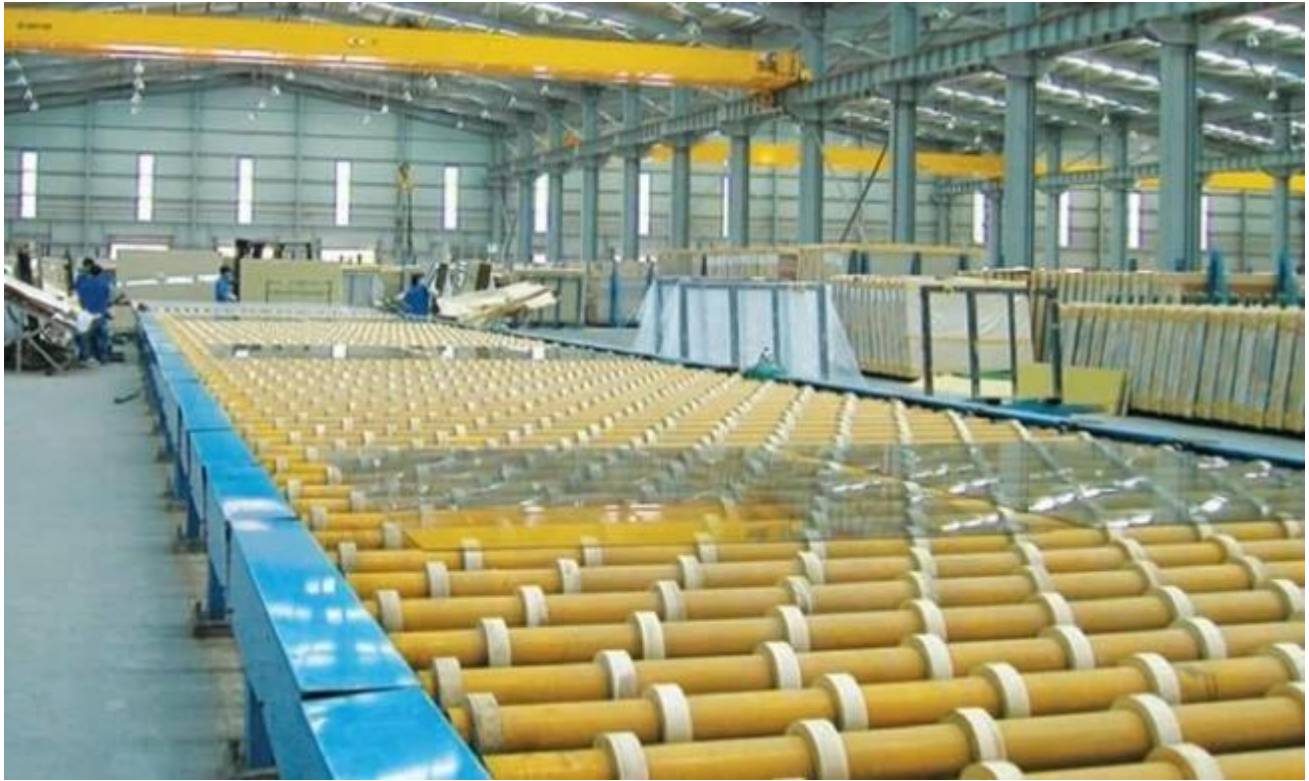
China Float Glass Packaging