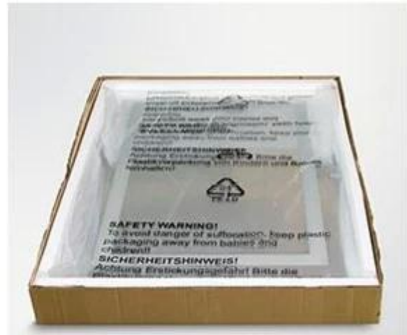
Put LED mirror into inner carton