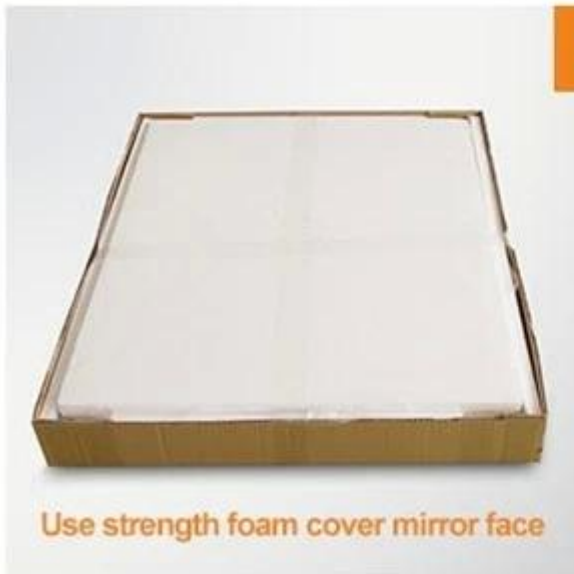
Use strength foam cover mirror face