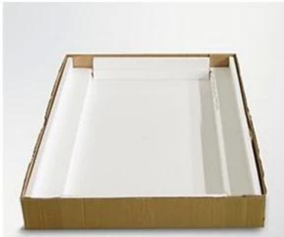
Inner carton with foam all around