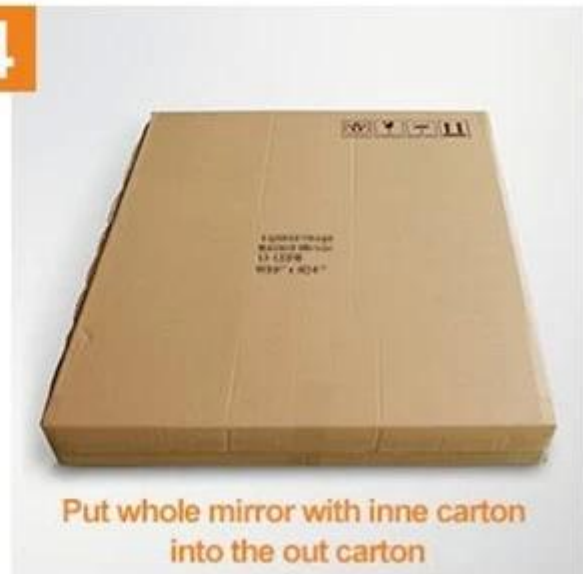
Put whole mirror with inner carton into the out carton