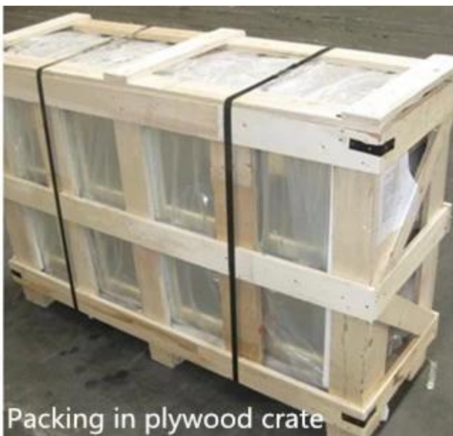
Packing in plywood crate