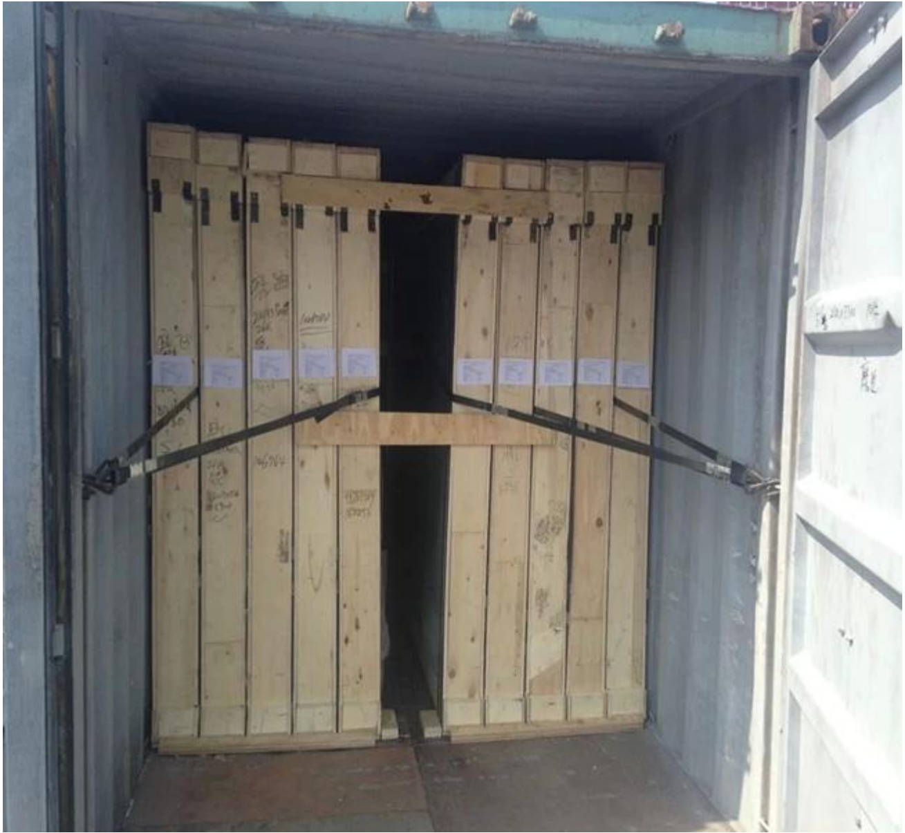
Factory show of blue color glass