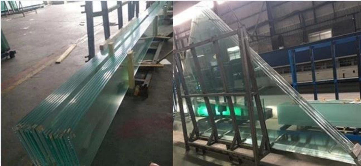
Glass packaging by JimyGlass