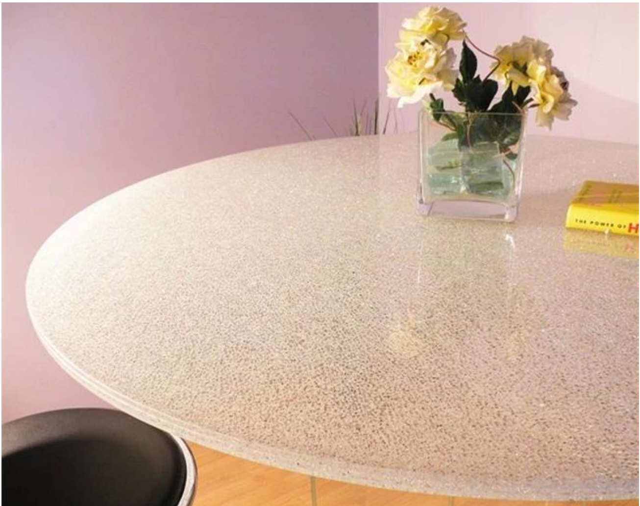
Clear crackled tempered glass table tops: