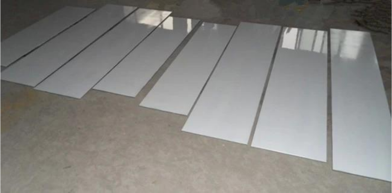
Different Colored Lacquer Glass: