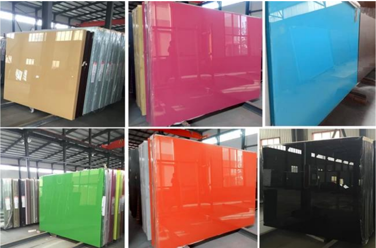
Lacquer Glass production and warehouse: