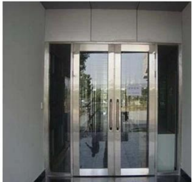
Insulating fire-resistant glass used for buildings partition