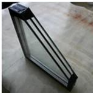
3. double insulated glass