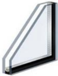
1. Insulated glass