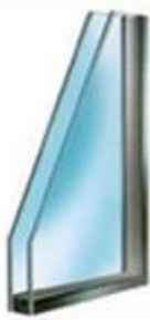
2. low-e insulated glass