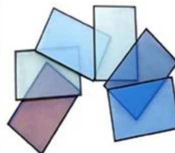
4. reflective insulated glass