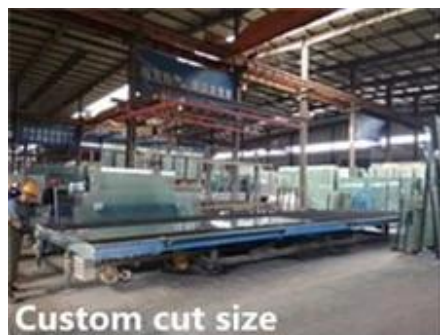
Custom cut size