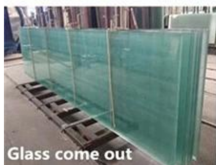
Glass come out