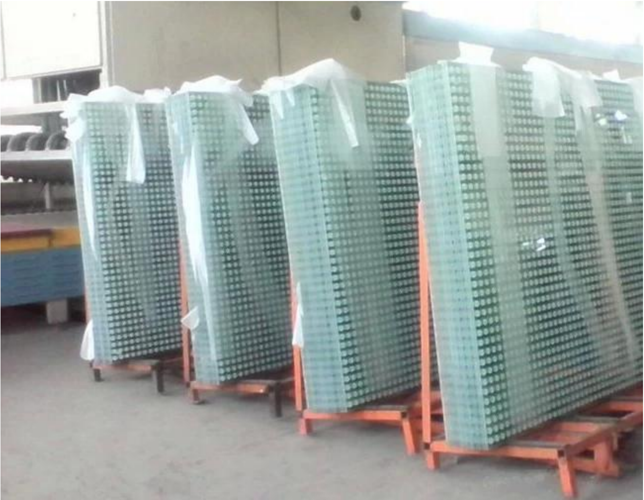
Silk-screen Printing Glass Workshop