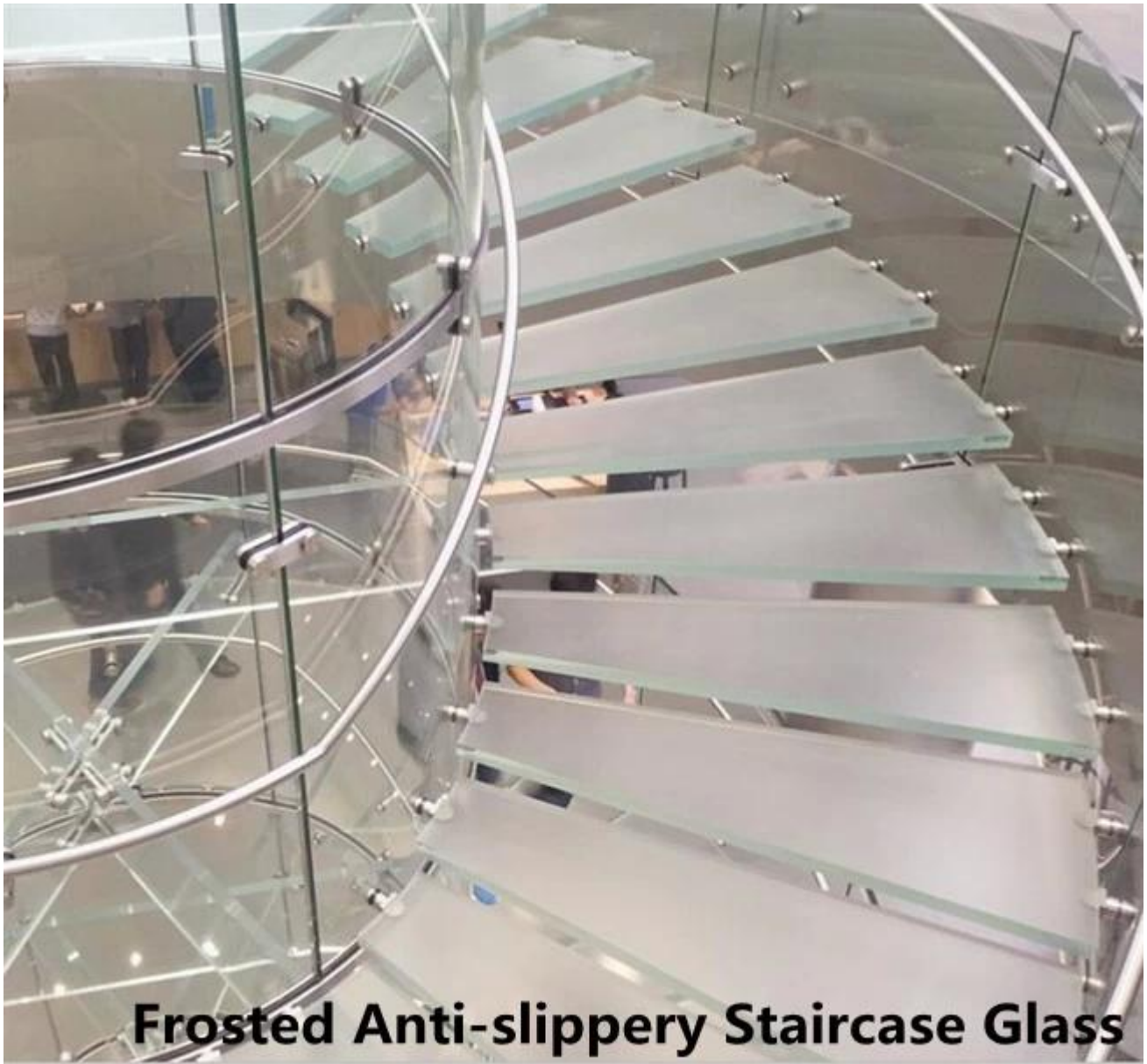
Frosted Anti-slippery Staircase Glass