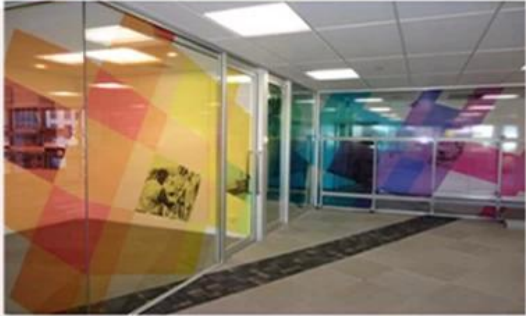
Laminated tempered PVB Film glass application