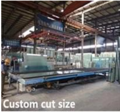
Custom cut size