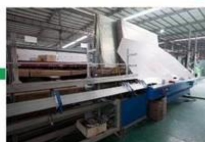
Aluminum frame folding machine