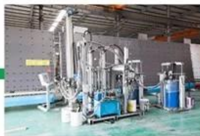
Injected sealant machine