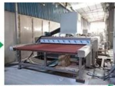
Glass cleaning and drying machine