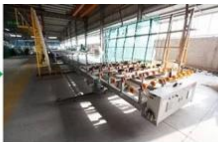
Glass cutting machine