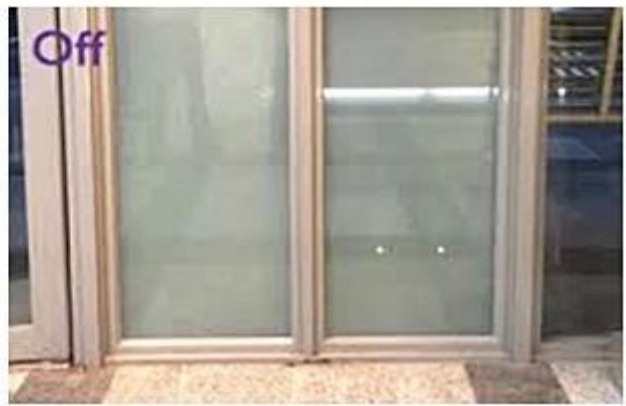
Switchable smart pdlc film glass used for meeting room