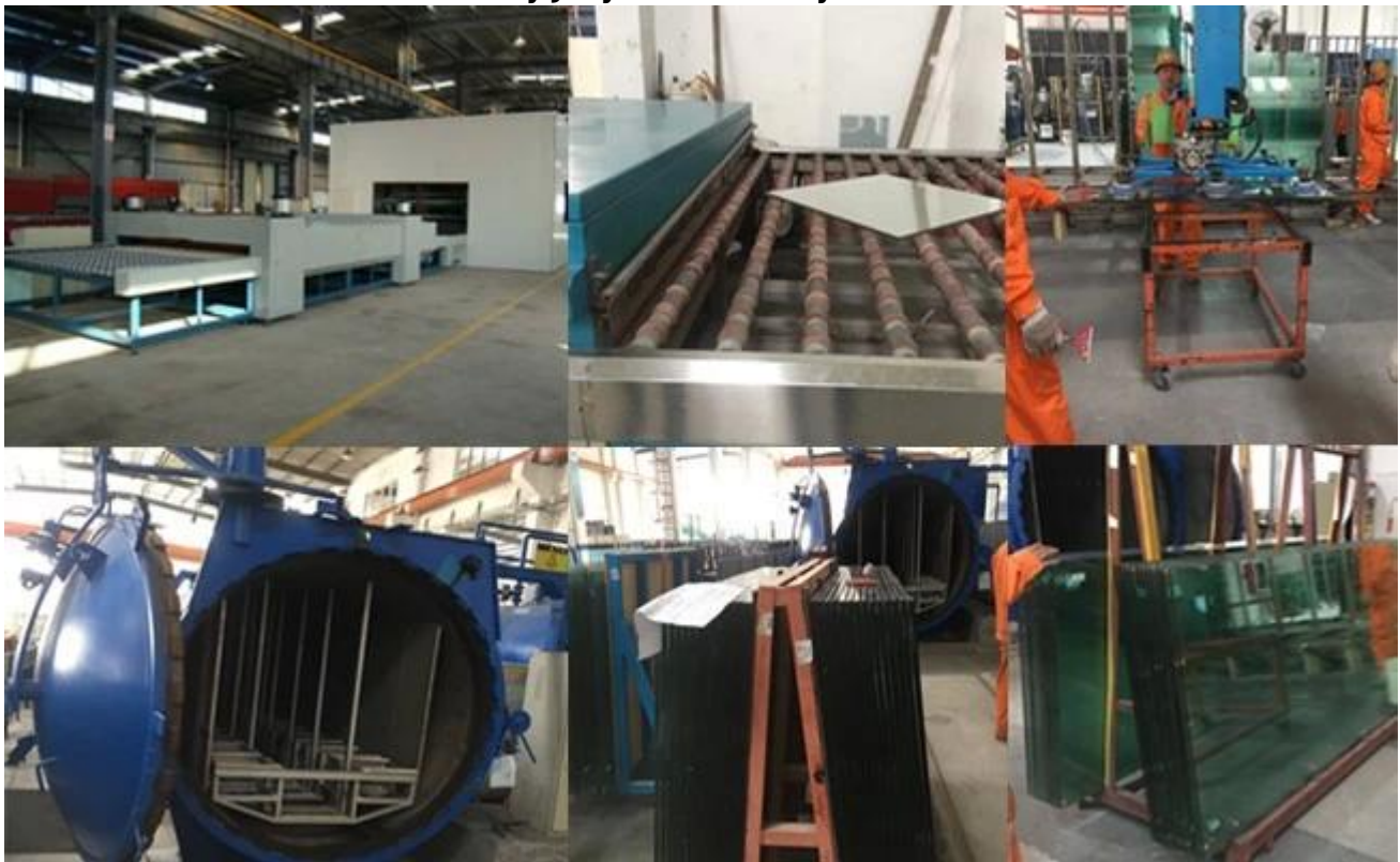
The applications of 15+15mm laminated safety glass