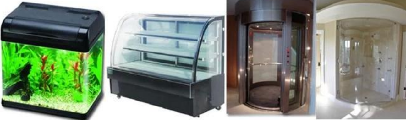
10mm Curved annealed glass used for display showcase: