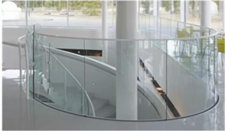
High quality safety curved ESG glass panel