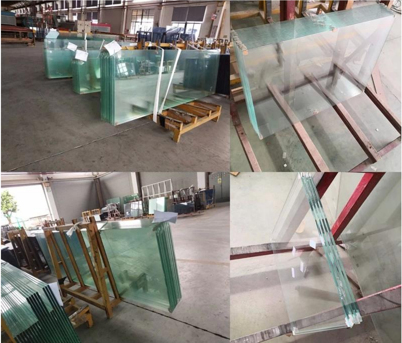
Some projects photo of 12mm extra clear tempered glass shares