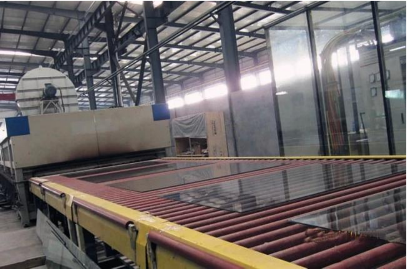
Bronze Reflective Glass Warehouse