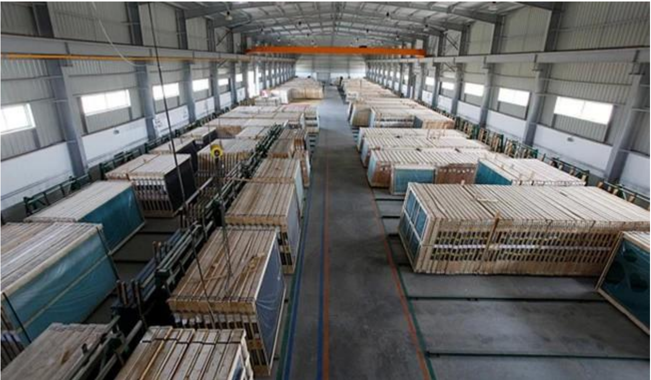
Bronze Reflective Glass Safety Loading