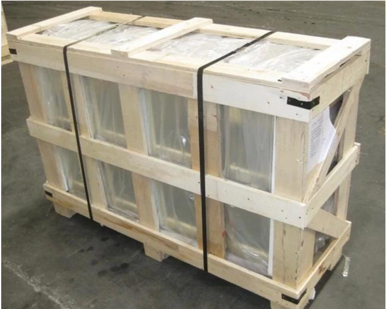
Safety loading for glass lift: