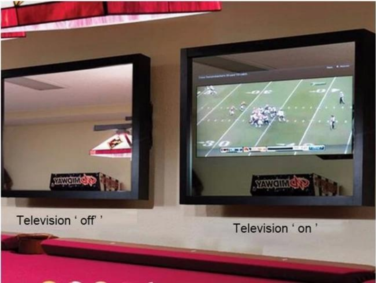
Factory Price two way mirrors bathroom