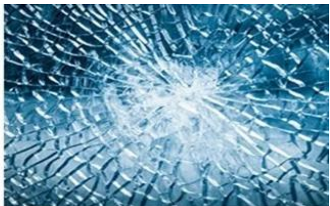
Tempered glass breaks into many small pieces with less sharp edges.