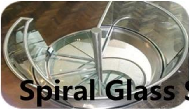
Spiral Glass Stair Railing