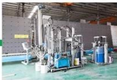
Injected sealant machine