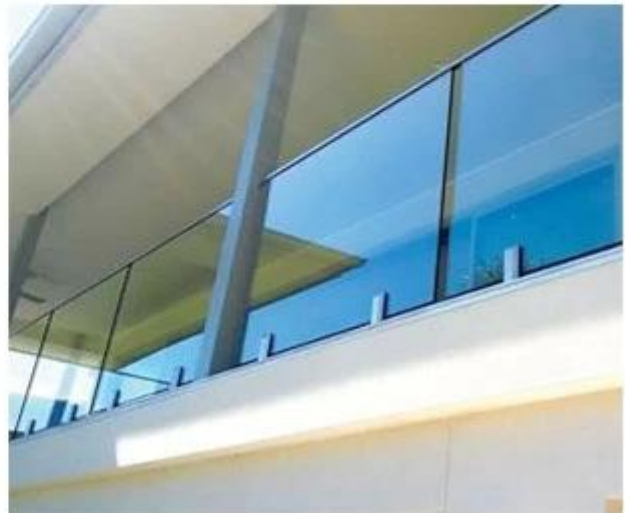
The processing of tempered glass