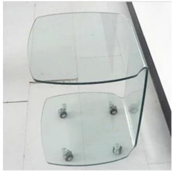
Bent glass safety packing and loading