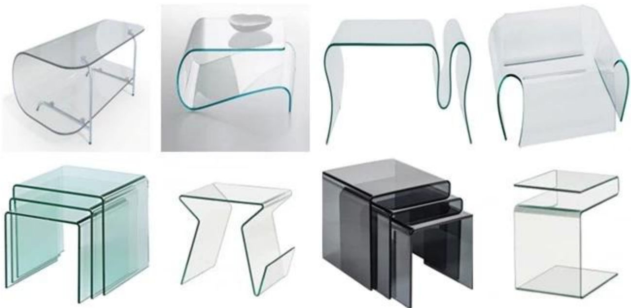
Bent annealed glass application