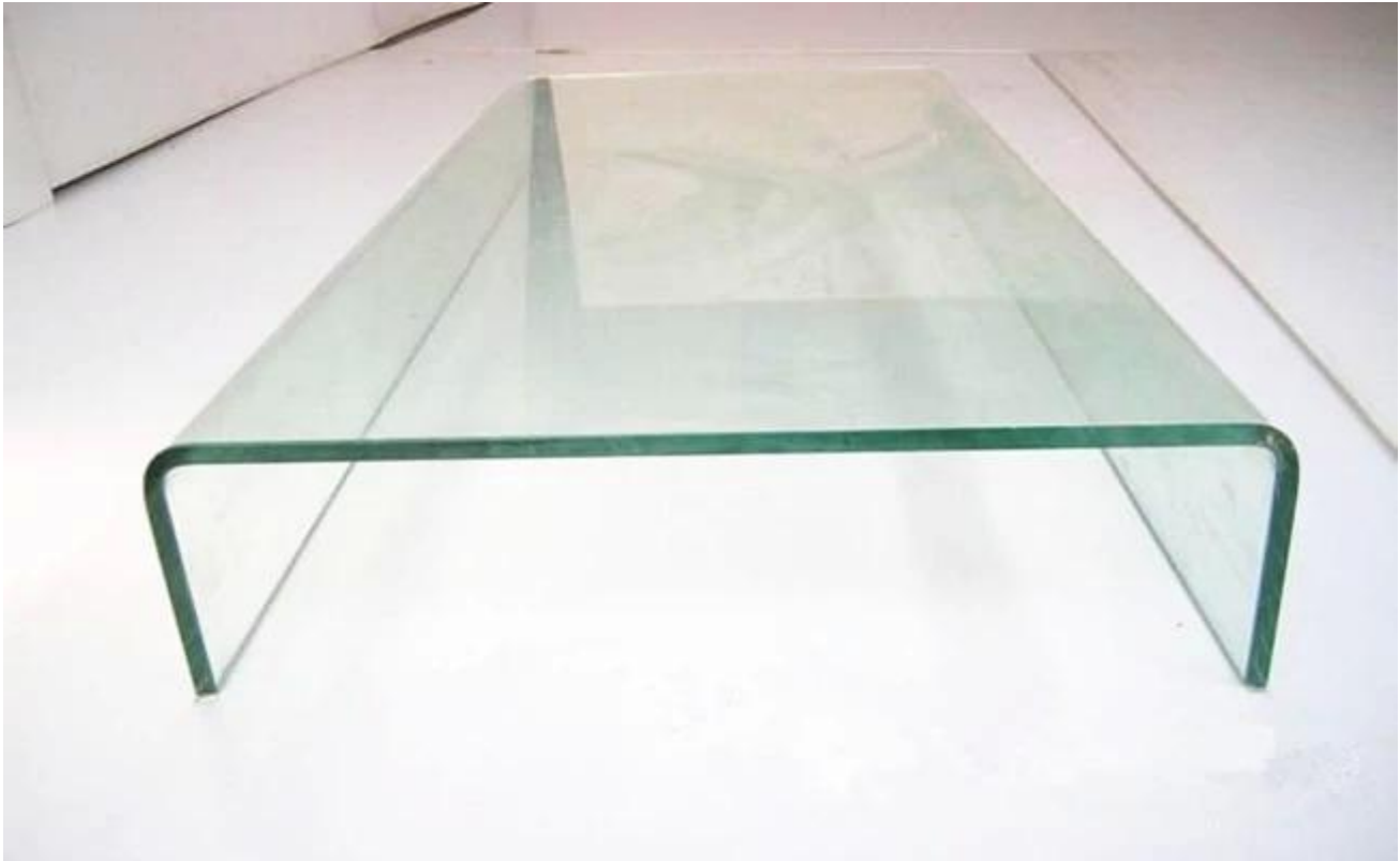
Different shapes curved annealed glass