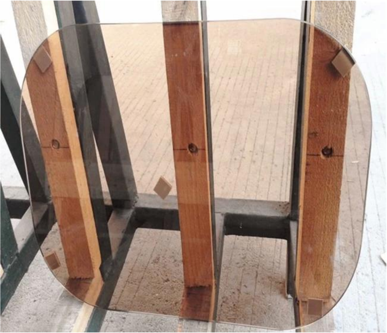
10mm Bronze Tempered Safety Glass Application: