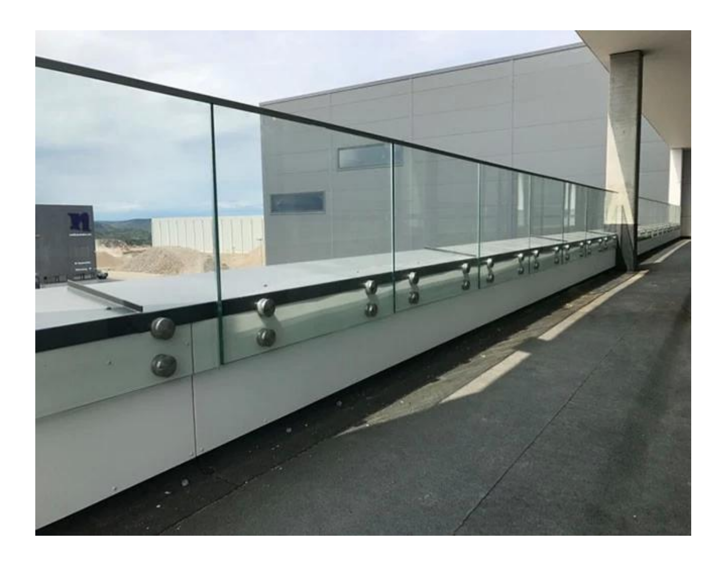
Cured toughened laminated glass balustrade