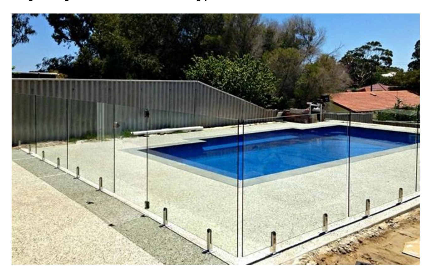
The frame of toughened laminated glass balustrade