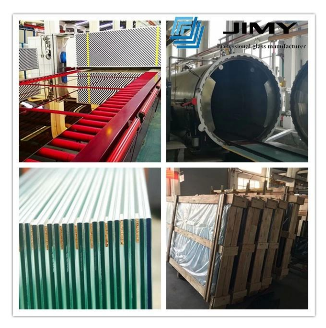
Why choose 11.14 clear tempered laminated glass from Jimy Glass?