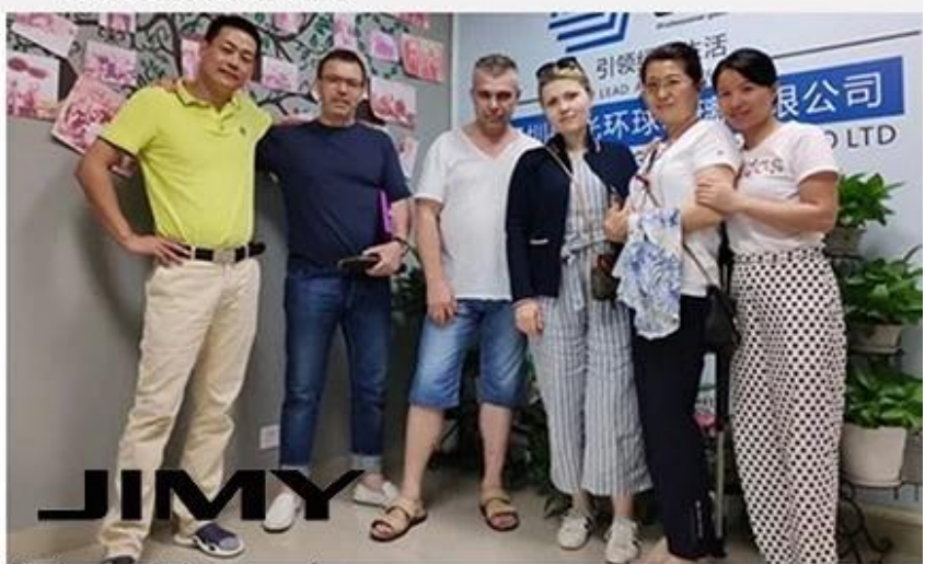
Professional glass manufacturer