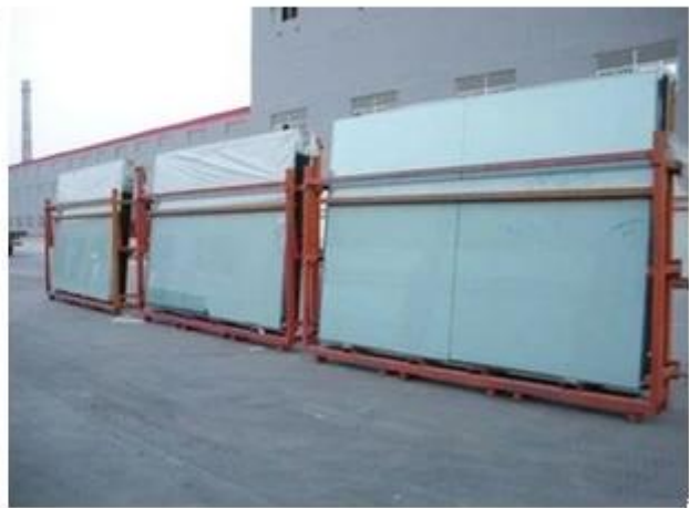
Acid Etched Glass Strong Packing