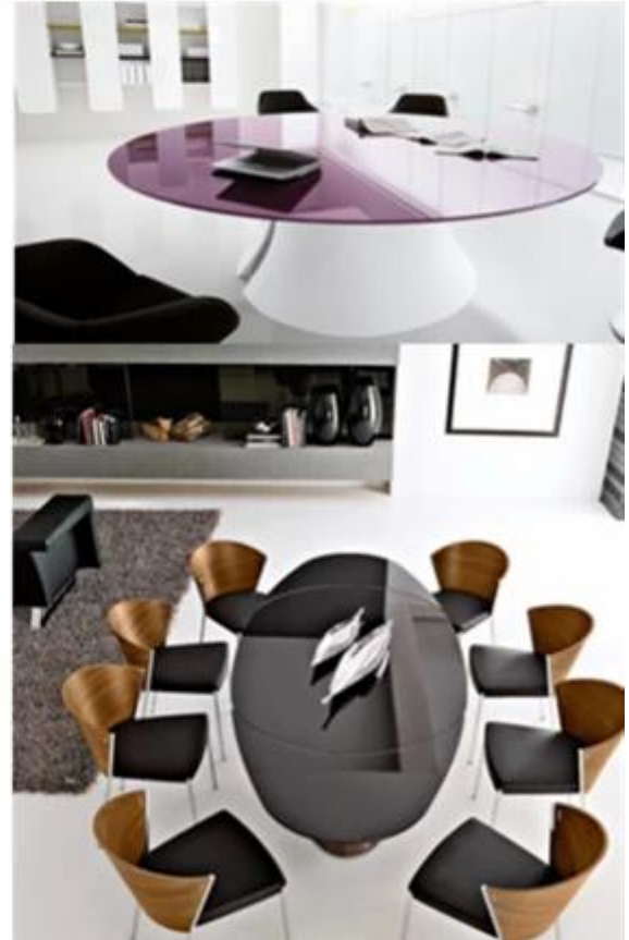
Custom 12mm tempered glass use for office desk: