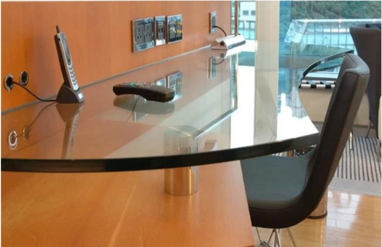
12mm tempered glass for Conference Glass Top: