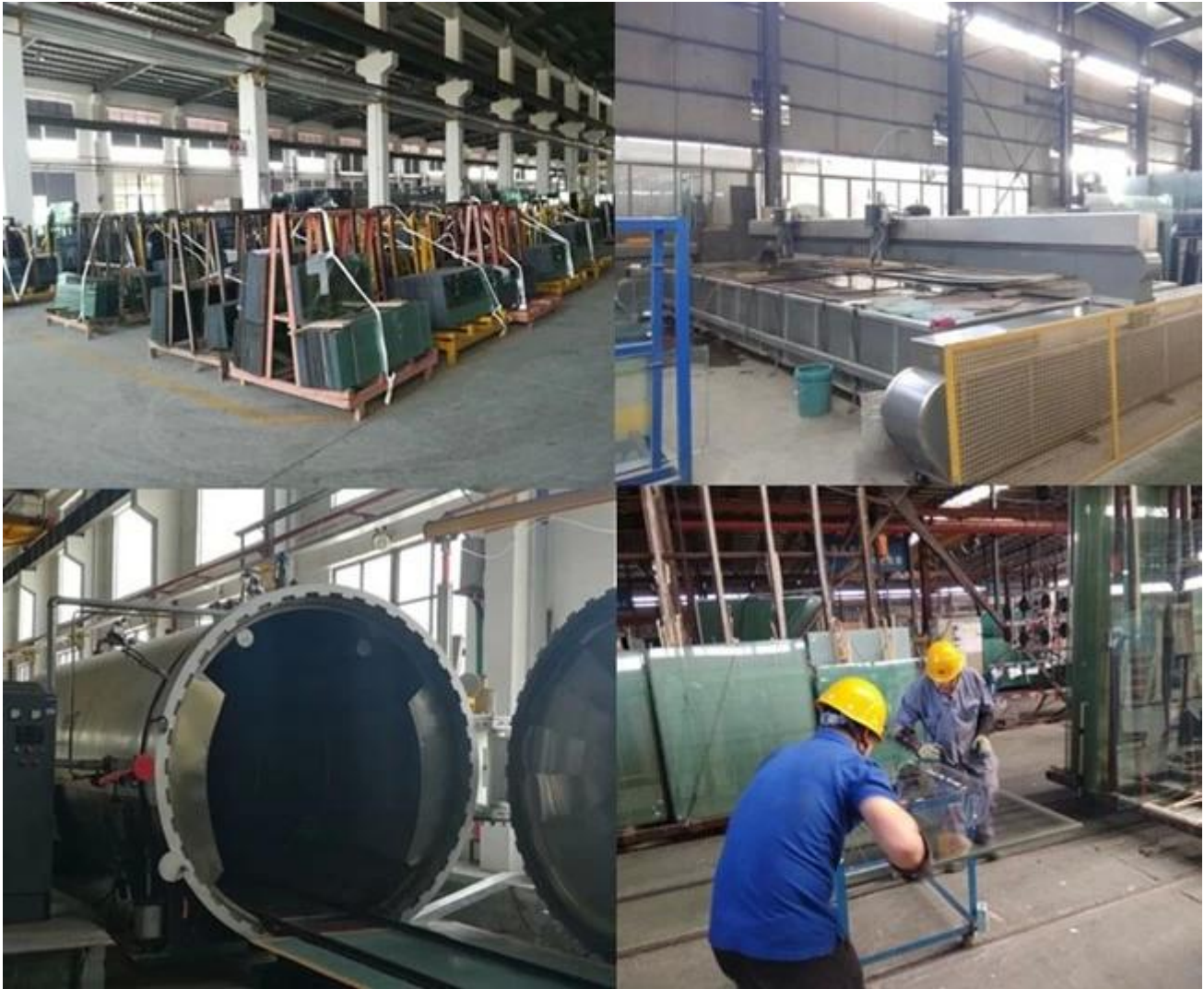
Packing for 13.52mm Clear Laminated Tempered glass panel