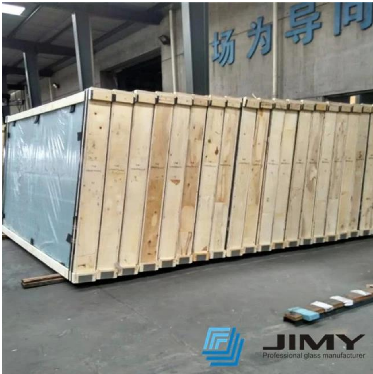
Production line for tempered laminated glass