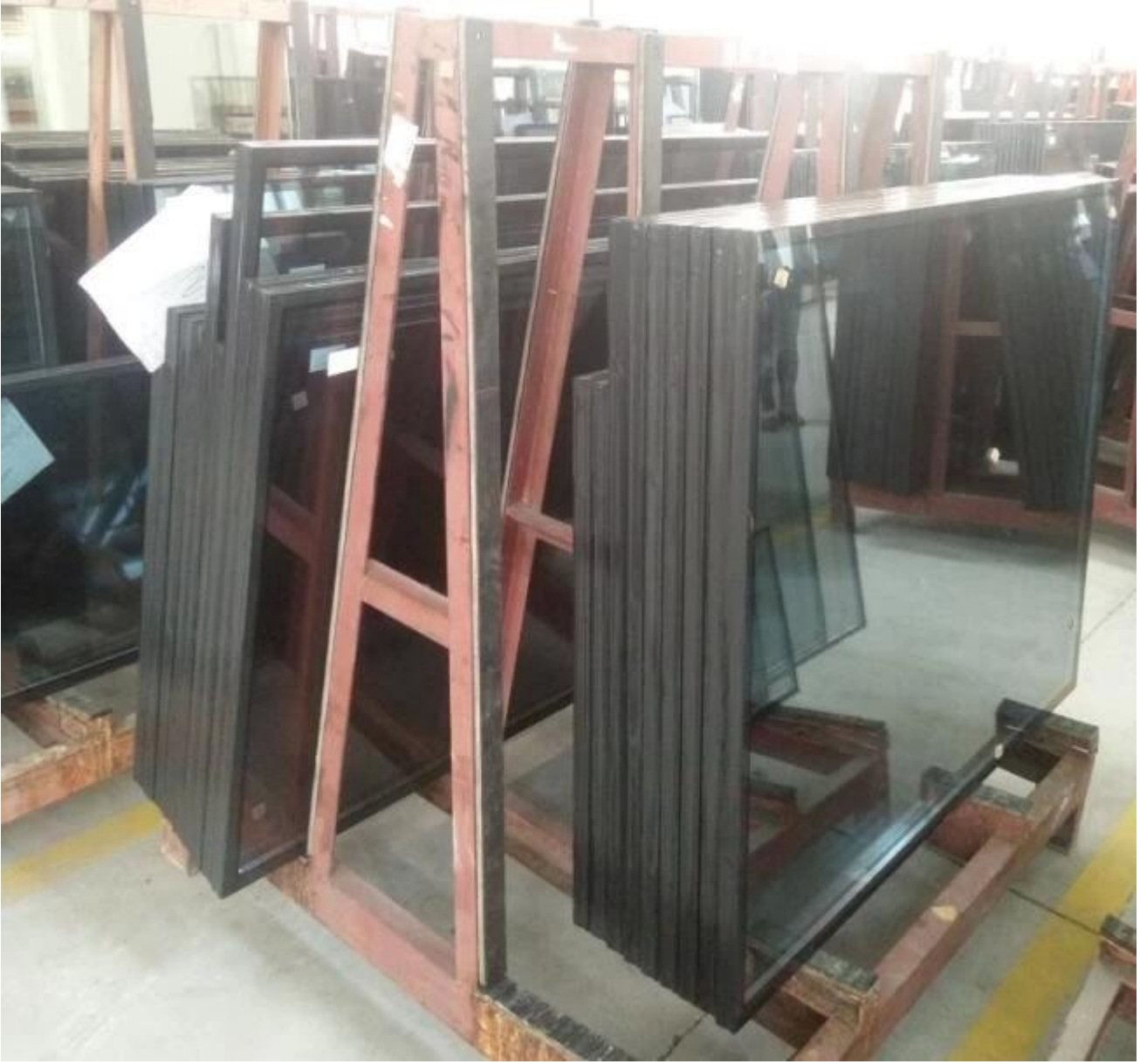
Insulated Glass Production Line