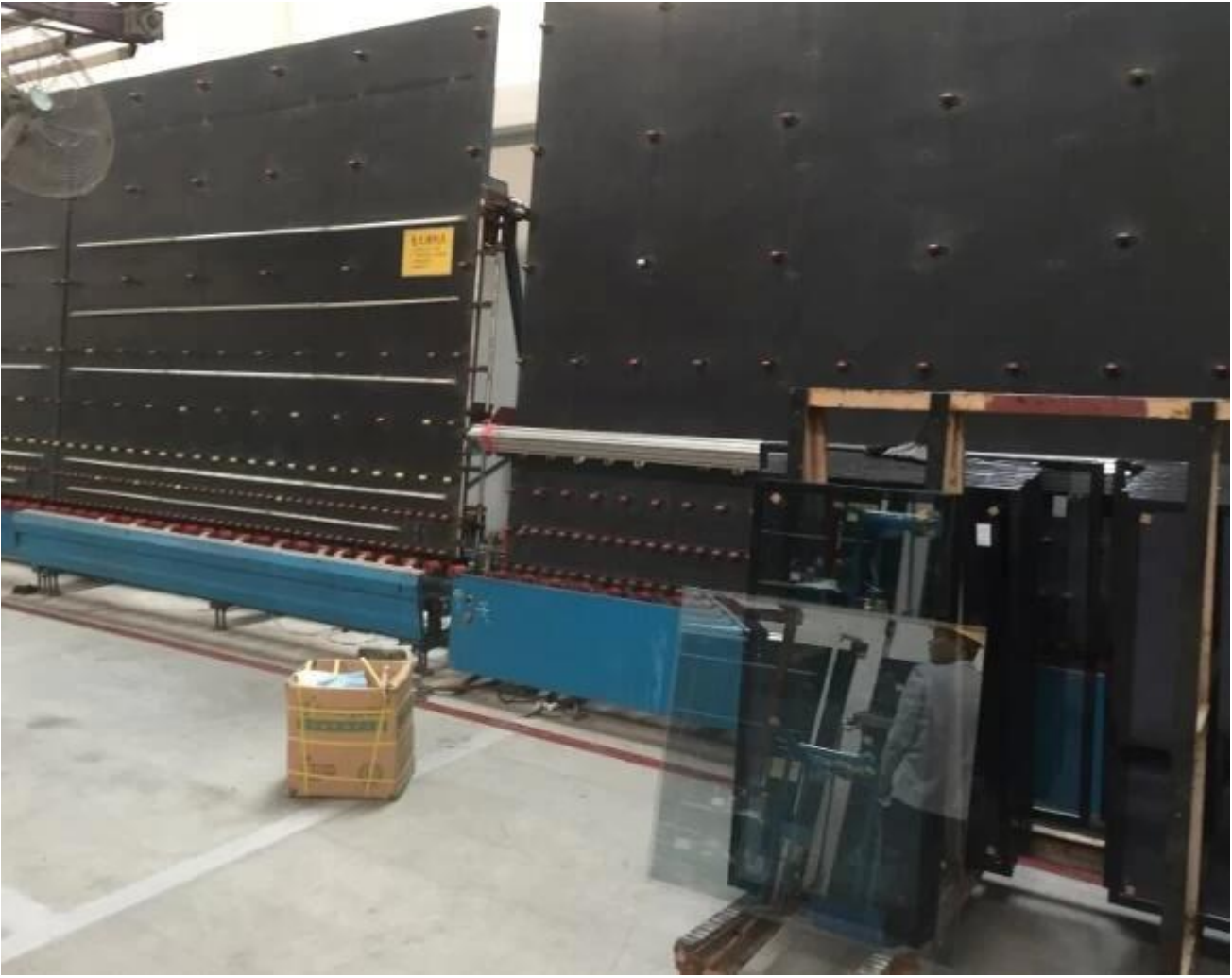
Packaging and Loading by Jimy Glass