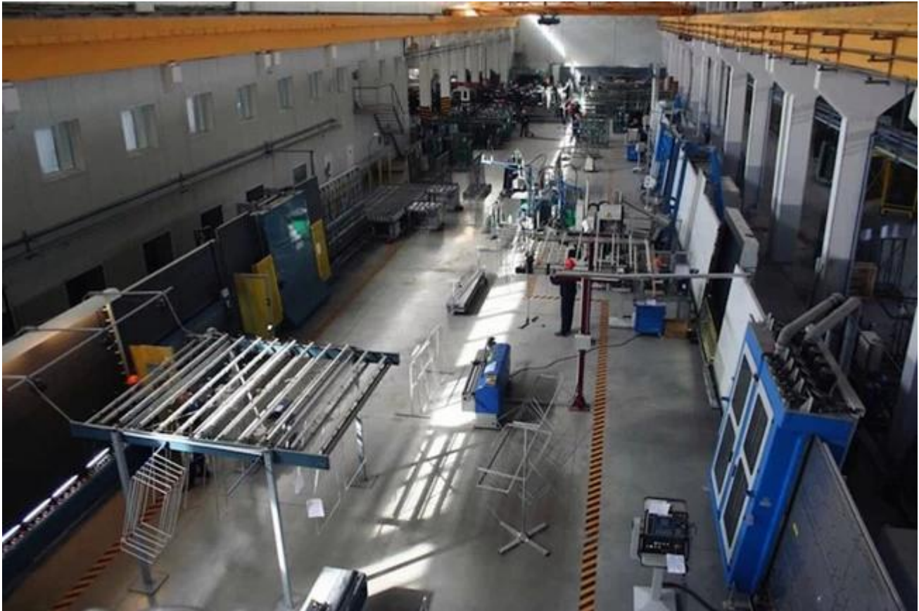
Insulated Glass Safety Loading