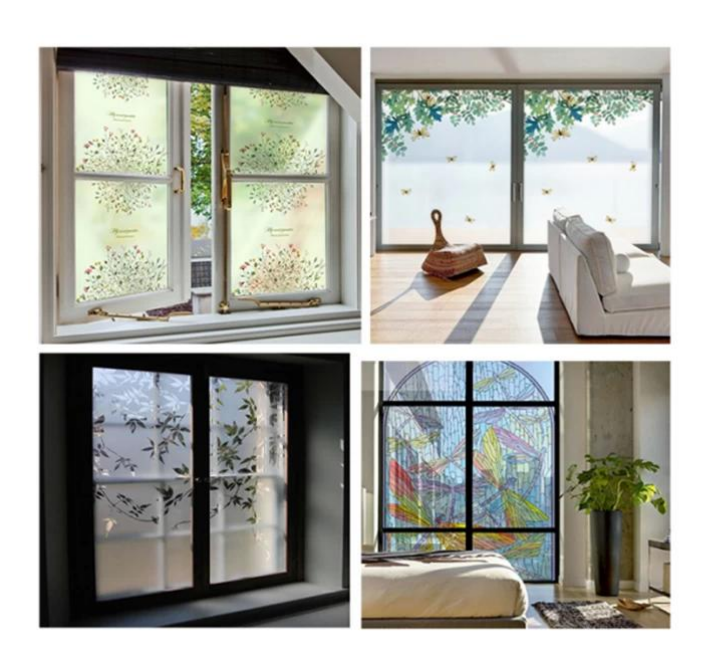
digital glass printing for bathroom