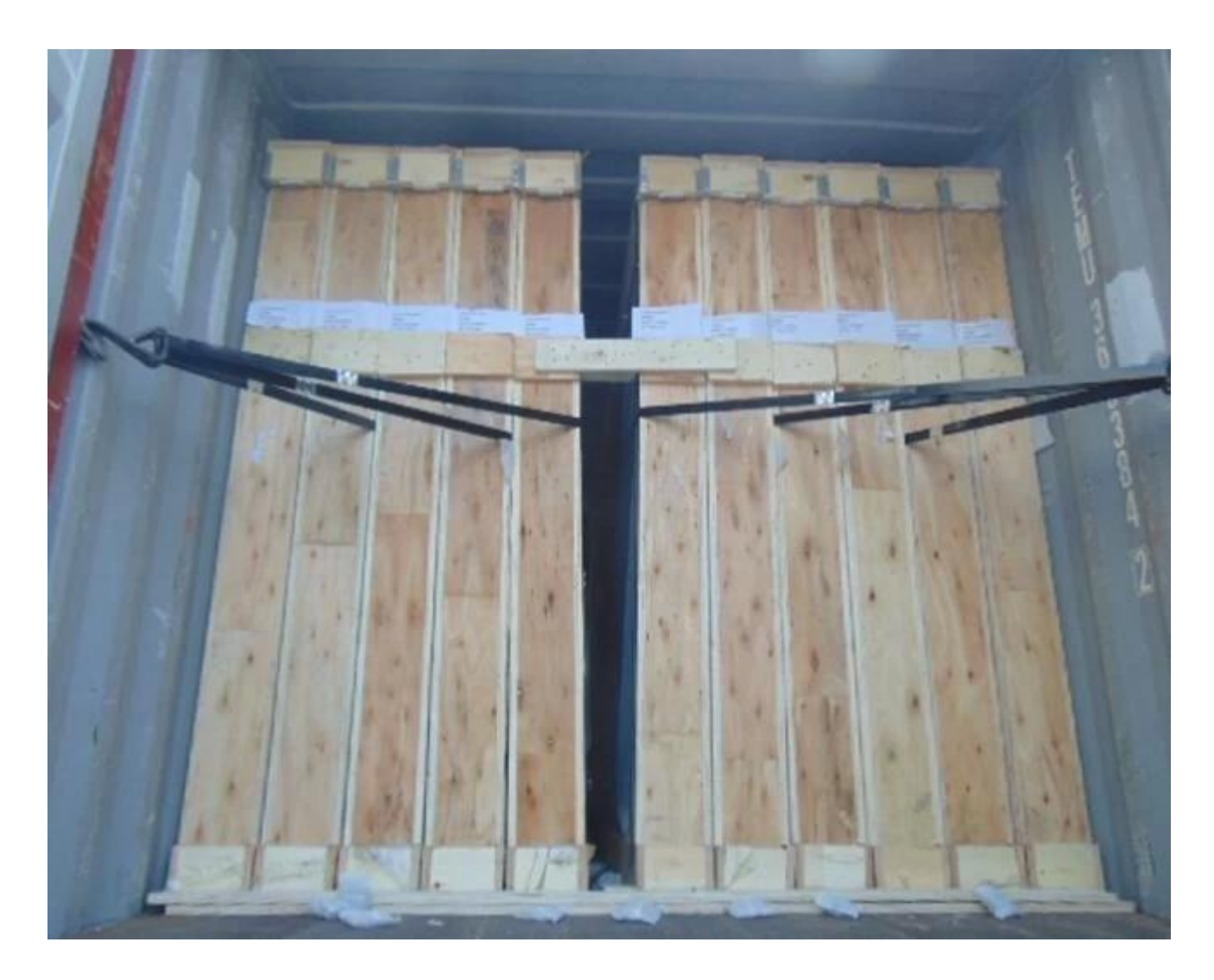
Applications of Tinted Float Glass