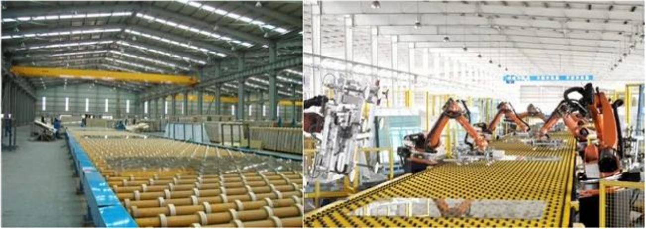
Clear Float Glass Strong Packing and Safety Loading