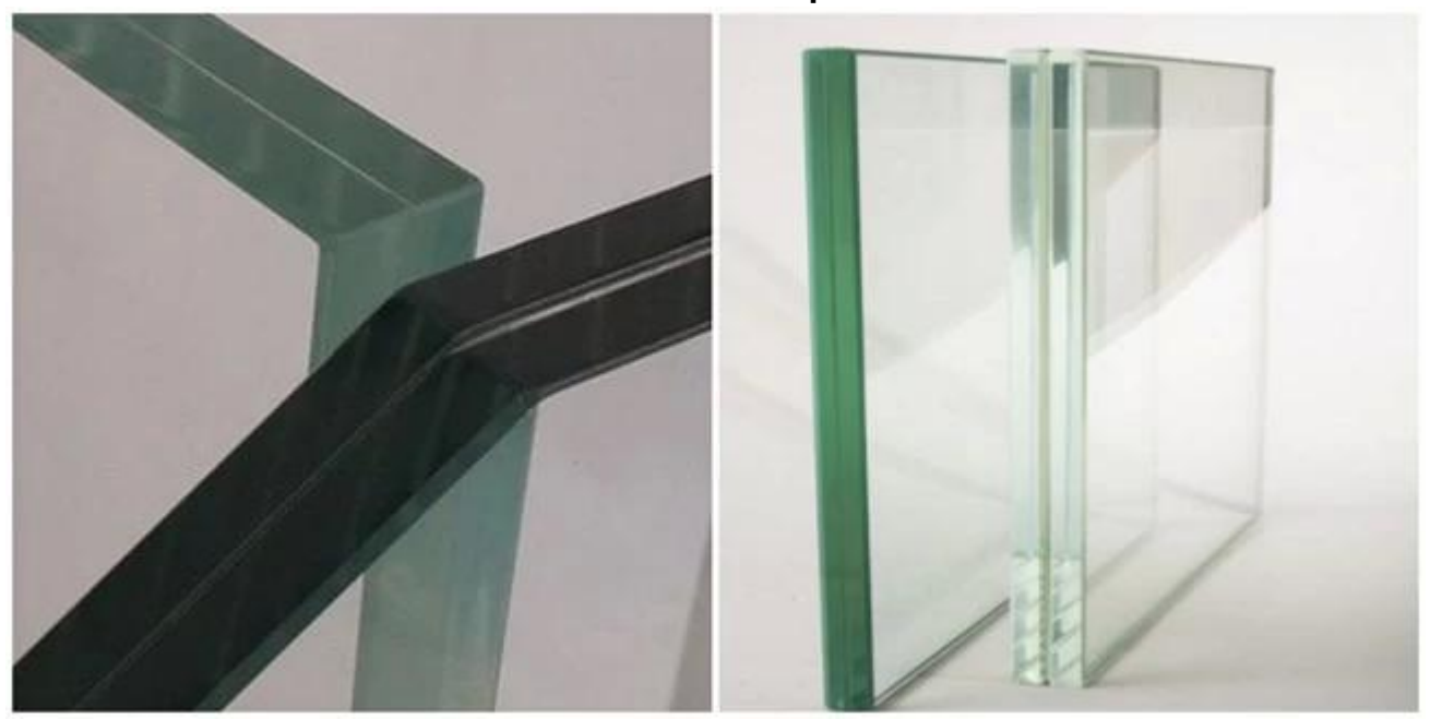
Difference Between Normal Laminated Glass & Tempered Laminated Glass been broken