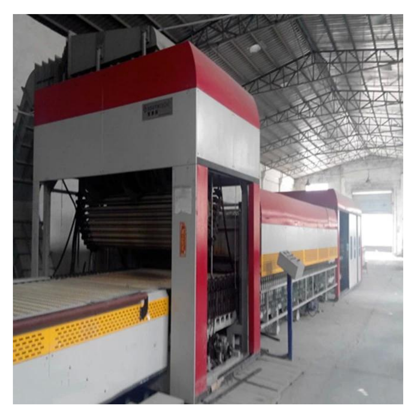
Laminated Glass Production Plant