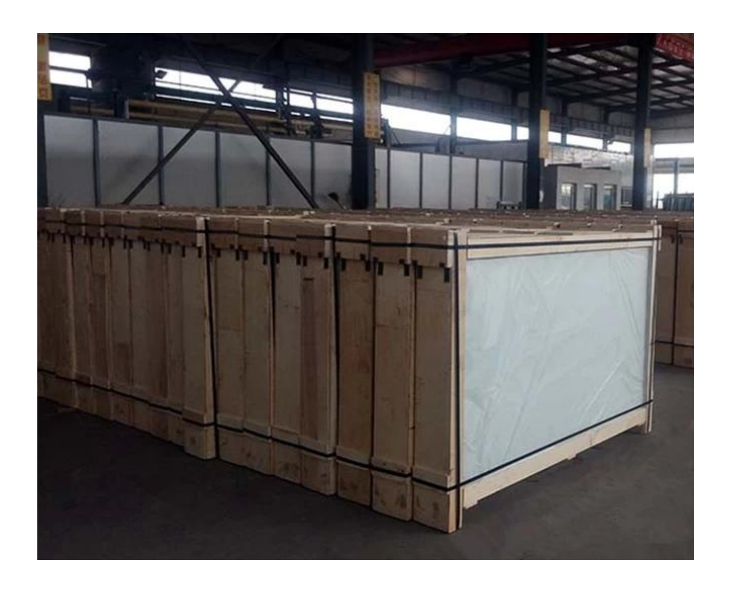
Standard Size Acid Etched Glass Safety Loading