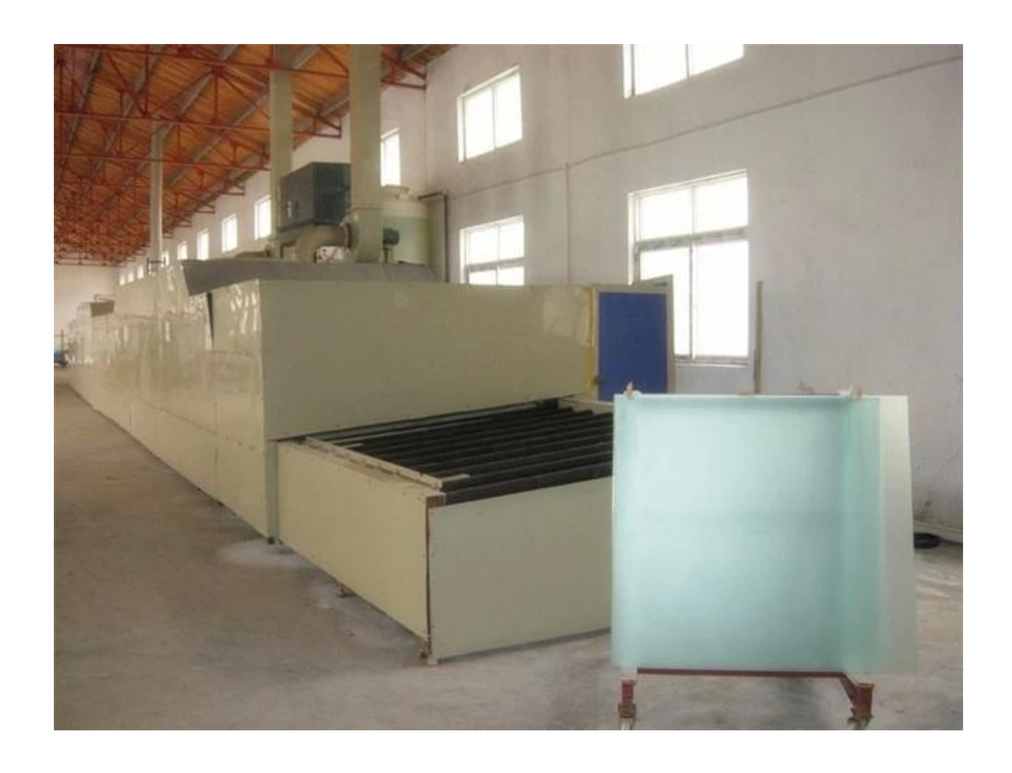
Acid Etched Glass Strong Packing