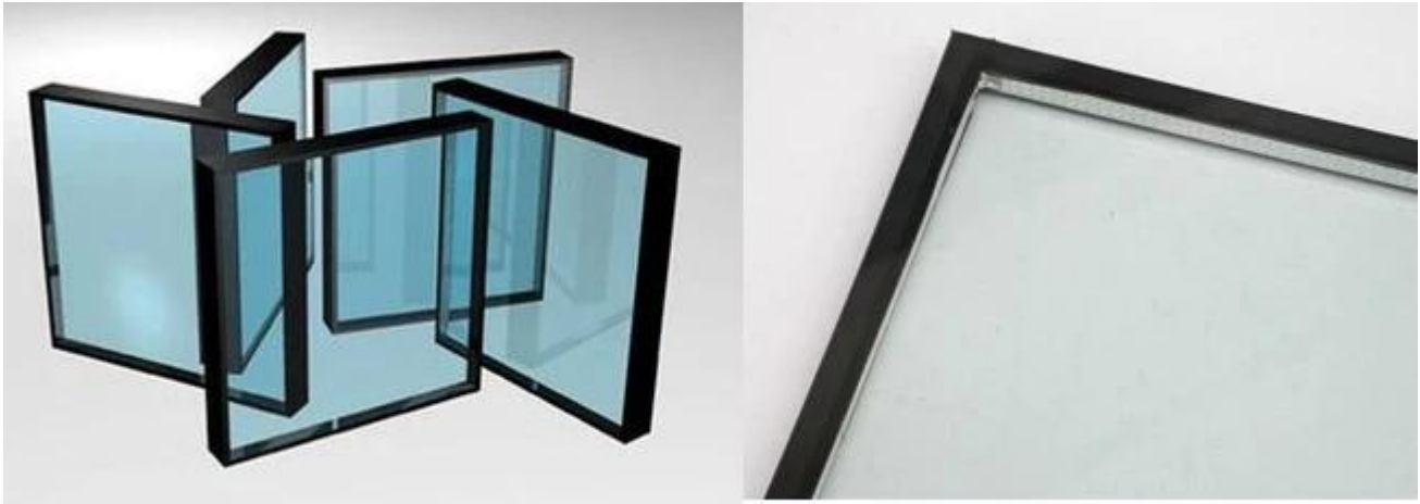
Picture of tempered Low-E insulated glass curtain wall